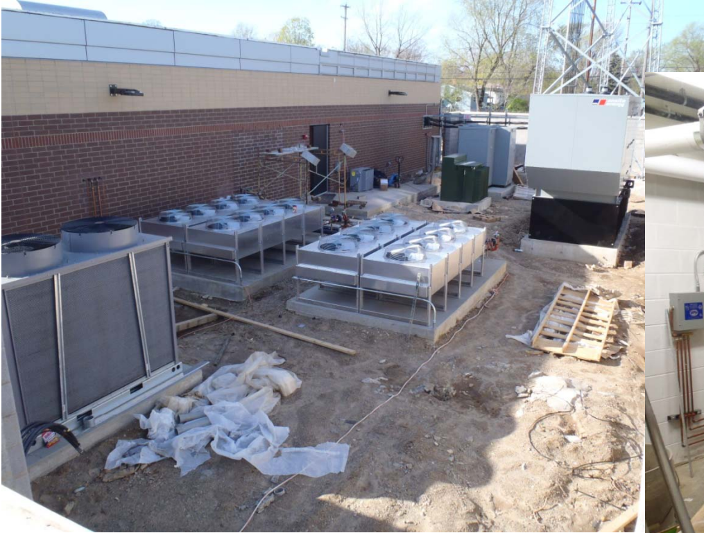
East Elevation (Courtyard)