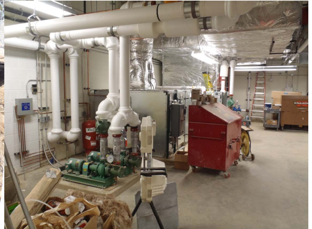
Air Handling Unit (Mechanical Room)