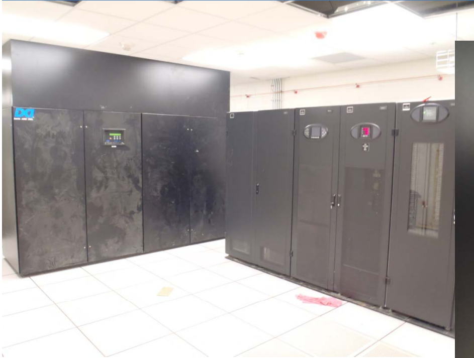
Data Center UPS & Air Conditioning Unit