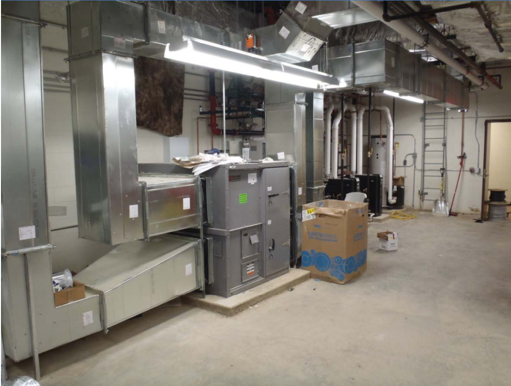
Energy Recovery Ventilator (Mechanical Room)