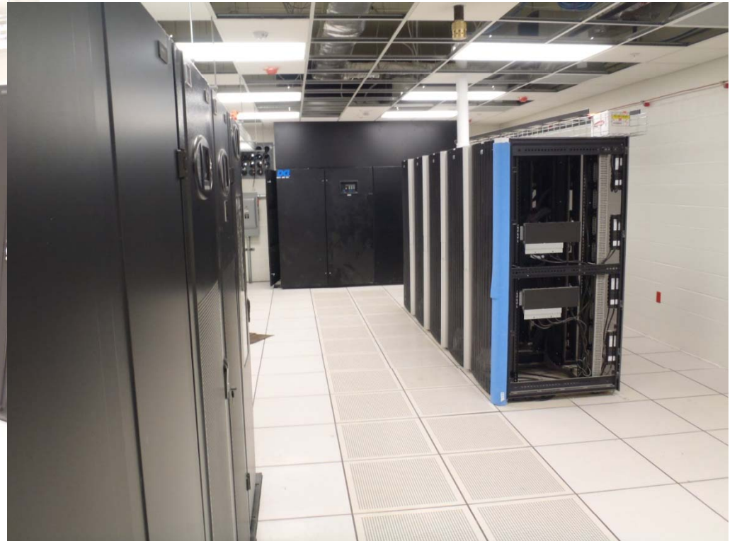
Data Center UPS, Racks, & Air Conditioning Unit