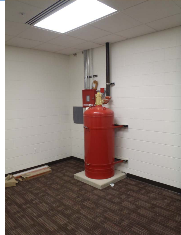
Data Center Fire Suppression System (Facility Workroom)